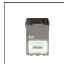
FM Batteries JMMN4025