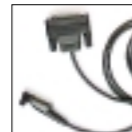
Programming Cable JMKLN123