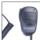
Remote Speaker Mic JMMN4067