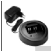
Rapid-rate Desktop Charger PMTN4025