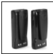
NiMH Battery & Belt Clip PMNN4008