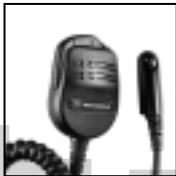
Remote Speaker Microphone PMMN4002