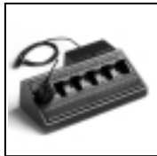
Multi-unit Charger PMTN4028