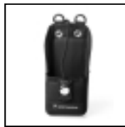
Carry Case HLN9701