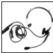
Light Weight Head Set AZRMN4018